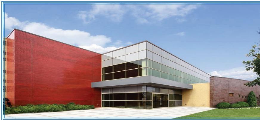
An exterior view of CHASS's new facility.

The 48,000 square foot new medical complex replaced a cramped 15,000 square foot former auto dealership on West Fort Street and Junction, the health center's original facility. Four medical pods, totaling 8,300 square feet of medical clinic space, now support 24 examination rooms and four procedure rooms. Six dental operatories, Pharmacy services, lab and WIC, all located on the first floor, complement the medical services area. The "green" design features an outdoor healing garden with flower beds and public art as well as a vegetable garden to enhance nutritional and agri-education initiatives. The increased capacity allowed CHASS to eliminate a two-month waiting list for new patients and implement important wellness, prevention and intervention programs for vulnerable populations.