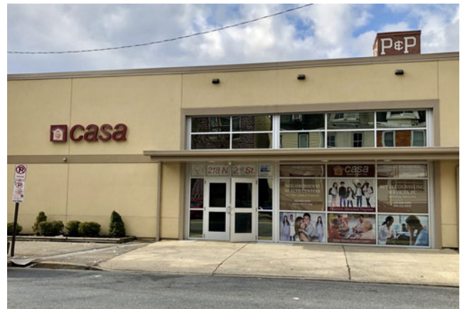
The current NHCLV Allentown site, before the renovation and expansion project.

The health center was founded by a group of local residents concerned about the community's obstacles in getting routine and preventive primary care services due to language and transportation barriers, and extreme poverty.