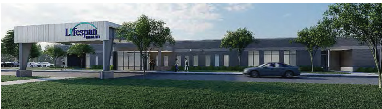
Artist rendering of the proposed new facility.

Lifespan's service area falls behind the country and the state of Tennessee for several social determinants of health, demonstrating the vital need for health centers in rural communities. For instance, 47% of the population Lifespan serves has an income below 200% of the federal poverty level—more than both the state (37%) and country (33%). At $36,126, the median household income of Lifespan's service area is also lower than both the state and country at $48,708 and $57,652, respectively. Twenty-three percent of those living within Lifespan's service area said they could not see a doctor due to cost, 1 further emphasizing the area's need for access to affordable care.