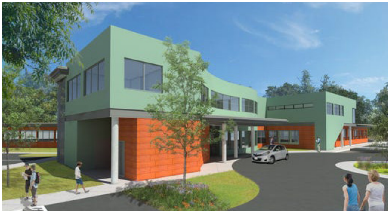
Artist rendering of the proposed Center of Hope.

The COH will also have a 5,000 sq./ft. housing unit with 16 dorm-style apartments for low-income young adults as part of the Helping Overlooked Students Thrive (HOST) program. HOST provides case management services to transitional-aged youth enrolled at Shasta College or California Heritage Youth Build Academy (CHYBA). Part-time jobs will be reserved at the COH for these young people. A Wellness Center offering a computer lab, an art/science maker space, other vocational training and rooms for educational and support groups will also be available to residents as well as the surrounding community.