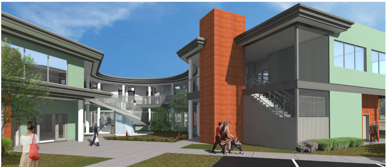
Artist rendering of the proposed Center of Hope building.

In 2015, Hill Country opened its first satellite clinic in Redding, CA, in response to the significant unmet need created by the Affordable Care Act and California's Medicaid expansion. While Hill Country has been committed to the integration of primary medical care and mental health treatment since its inception, current integration efforts have focused on complex care programs, treating the whole person and addressing the social determinants of health. Most recently, the health center has turned focus towards constructing its newest facility, the Center of Hope (COH).