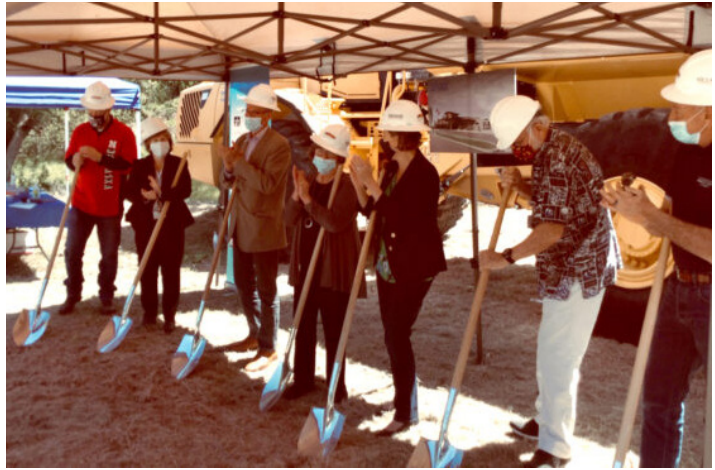
Groundbreaking of the new facility.

El Dorado CHC is responding to the unmet healthcare needs in the Placerville area by constructing a new, state of the art 30,000-square-foot clinic facility. This project will consolidate two existing clinic sites into a larger facility, nearly doubling existing capacity and allowing for a variety of new services. In 2018, EDCHC purchased a 12-acre parcel located at 4212 Missouri Flat Road for $2 million, with the intention to build a modern medical facility to better serve its community.