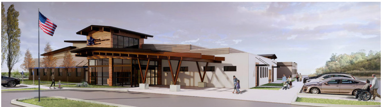
Artist rendering of the proposed new facility.

As the dominant health center throughout its primary and secondary service areas, EDCHC provides much needed care to its quickly growing population, the majority of which is living under the federal poverty level (FPL). According to 2020 HRSA Uniform Data System (UDS) data , 87% of EDCHC's patients live 200% below the FPL, and 7% are homeless. The racial and ethnic distribution of EDCHC's patient population is 72% White, 24% Hispanic/Latino, 1.5% Asian, and less than 1% Black/African American. EDCHC's total number of patients jumped 29% from 2015 to 2019 (9,157 to 11,832 patients), but fell in 2020 to 10,797.