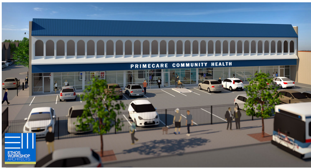
Artist rendering of PrimeCare's new facility, currently under construction, in northwest Chicago, IL.

In 2017, PrimeCare served 20,103 patients, 96 percent of which earned less than 200 percent of the Federal Poverty Level (FPL). Thirteen percent of PrimeCare patients were uninsured and 58 percent were Medicaid/CHIP recipients.