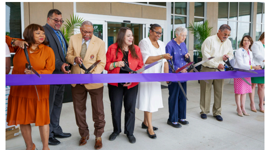
Ribbon cutting ceremony at the opening of FRHC's new campus.

To consolidate and better manage its rapid growth, in 2019 FRHC embarked on planning for an 84,000-square-foot new clinic facility on Miami Chapel Road in the Edgemont neighborhood of Southwest Dayton. The project location is a 4.4-acre former elementary school site purchased by FRHC in 2019, strategically located within the center's current service area and in close proximity to the Miami Valley Hospital and many of the clinical sites. This expansion will allow the organization to consolidate its clinical sites. FRHC's new Edgemont Campus will further expand the availability of much needed health care services since the closure of West Dayton's largest medical center, Good Samaritan Hospital, in 2018.