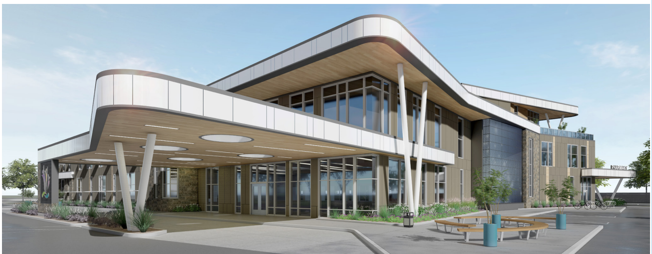
Artist rendering of the new facility.

According to HRSA UDS Data , 93% of FRHC patients live at or below 200% of federal poverty guidelines and 4.4% are homeless. Nearly 62% of patients are racial and ethnic minorities, with 55% Black/African American and 6% Hispanic/Latino. 11.5% of patients are best served in a language other than English. Given the service area's high rates of poverty and homelessness, the health center's affordable and accessible services are critical to improving the overall health of the community.