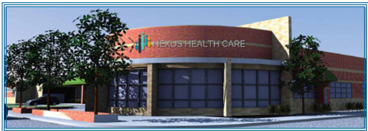
NHA's new Nexus Healthcare facility, currently under construction.

The vast majority of the patients served by NHA are classified as low-income. In 2013, NHA served nearly 9,800 patients, the majority of which earned less than 200 percent of the Federal Poverty Level. Thirty-nine percent of NHA patients were uninsured, and 29 percent were Medicaid recipients.