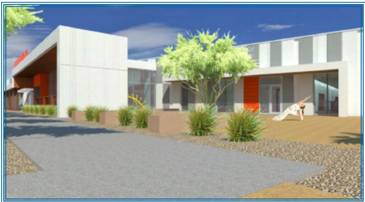
Artistic rendering of Mountain Park Health Center's new Tempe, AZ health center facility.

Mountain Park is committed to the mission of working with the communities it serves to sustain and improve health by providing affordable primary care. The majority of the patients served by Mountain Park are classified as low-income. In 2015, Mountain Park served 69,068 patients, 98 percent of which earned less than 200 percent of the Federal Poverty Level (FPL). Eighteen percent of Mountain Park patients were uninsured and 61 percent were Medicaid recipients.