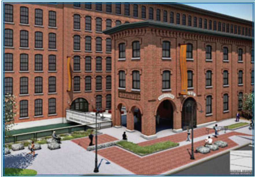
An exterior view of Lowell's new facility.

will expand operating hours and the range of health care services offered, including specialty medical care. LCHC will also integrate behavioral health services with primary care, and expand community outreach services and training programs. The health center is expected to have a more visible presence in the city with this new flagship facility.