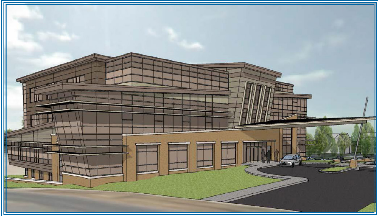
Architectural rendering of Family Health Center's new Kalamazoo, MI health center facility.

FHC's mission is to ensure that all members of the community have access to quality, comprehensive, patient-centered health care. The majority of the patients served by FHC are classified as low-income. In 2015, FHC served 26,019 patients, 99 percent of which earned less than 200 percent of the Federal Poverty Level. Fourteen percent of FHC patients were uninsured and 65 percent were Medicaid recipients.